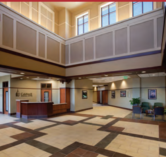
CALDWELL COUNTY HOSPITAL, PRINCETON, KY.