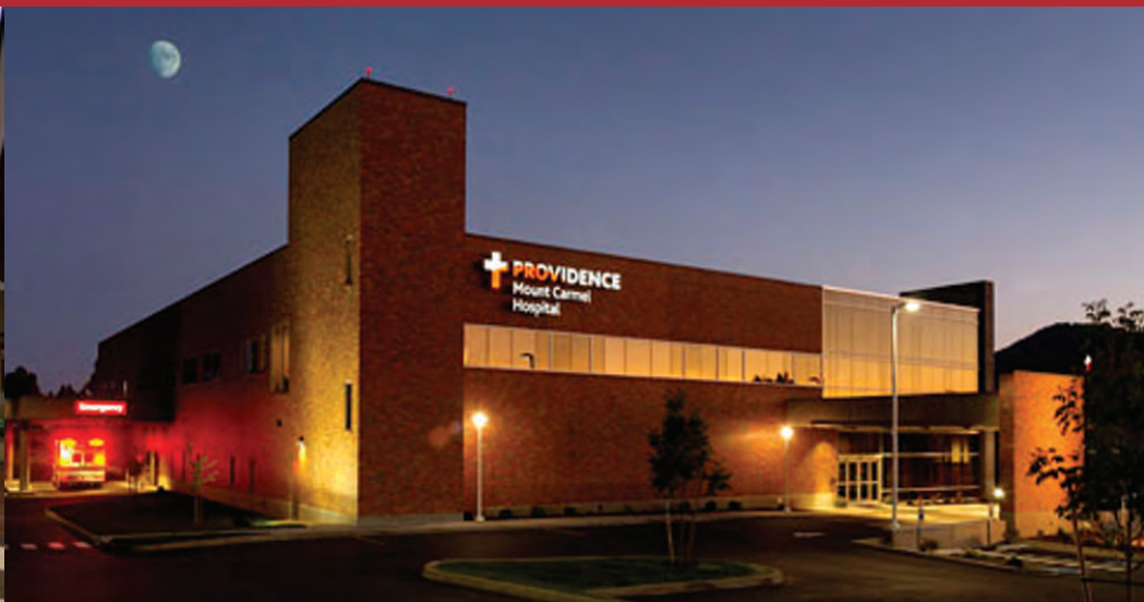
PROVIDENCE MOUNT CARMEL HOSPITAL, COLVILLE, WA.